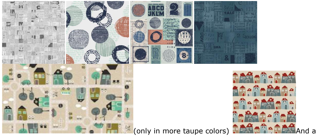
dot fabric. From Red Rooster: