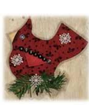
ornament in September.